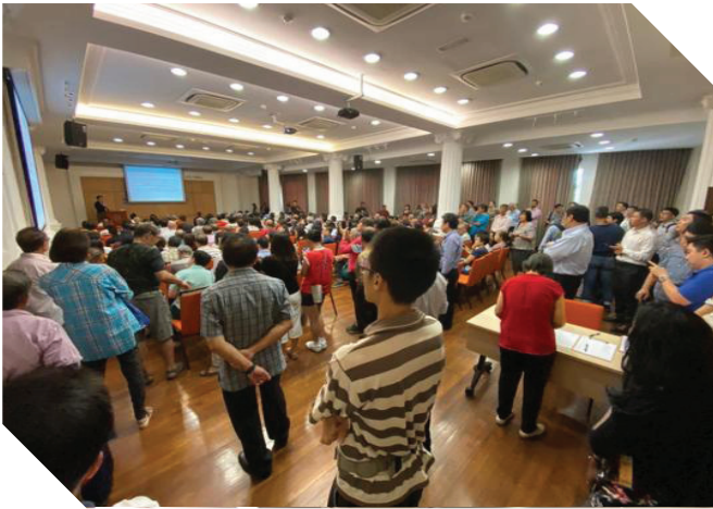
01/10/2019 “槟威门牌税调整”说明会 Briefing on the Adjustment of Assessment Rates