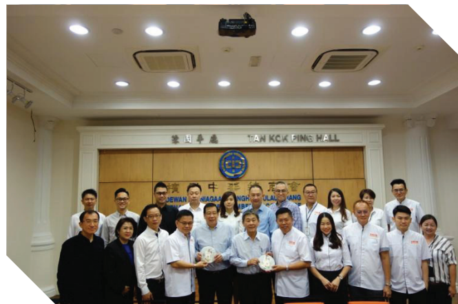
05/12/2019 光明日报管理层团队莅访 Courtesy Call by Guang Ming Ribao Sdn Bhd's Top Management