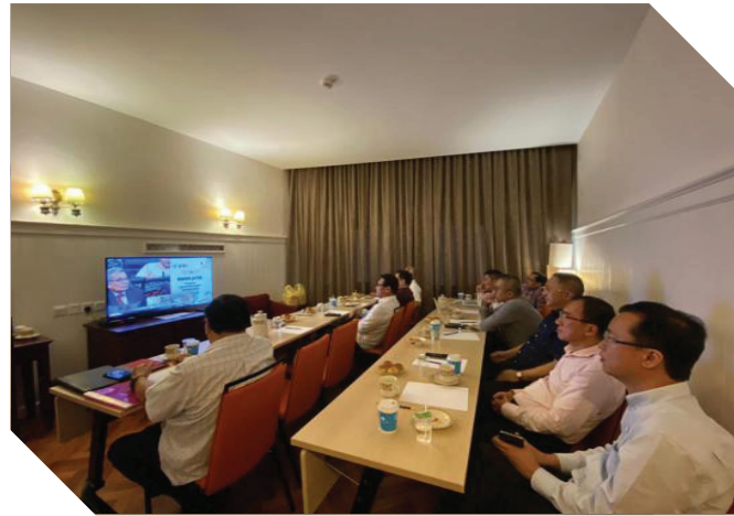
11/10/2019 收视财政预算案公布之现场直播 Live Telecast Viewing of Budget Speech