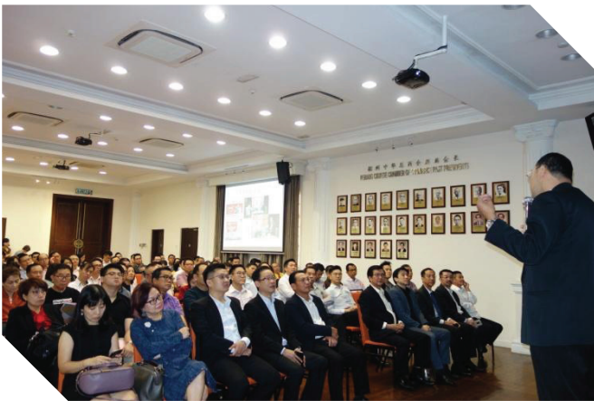
29/10/2019 “中美贸易战中寻商机”讲座会 Seminar on "Trade War - Moving Forward"