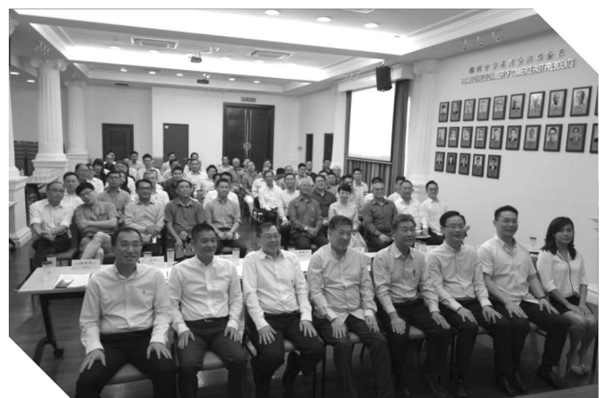
槟州中华总商会赴泰国曼谷拜访泰国中华总商会及参观2019国际自助售货系统与自助服务产品博览会 PCCC Delegation to Bangkok, Thailand to Visit Thai-Chinese Chamber of Commerce & Vending Asean 2019