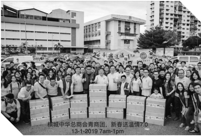
檳城中華總商會青商團，新春送温情7.0 13-1-2019 7am-1pm