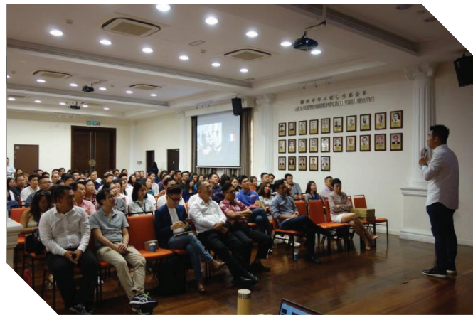
06/11/2019 “中小企业品牌战”讲座会 Seminar on "True Story of SME's Branding Battle"